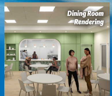
Dining Room Rendering