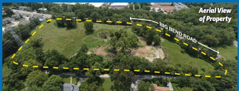
Aerial View of Property