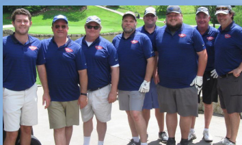
The Village Bar Foursome Hole Sponsors