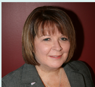
from the Executive Director

Our Lady's Inn has undertaken an initiative to become a Trauma Informed Agency. A trauma informed approach to the delivery of our services has, at its core, an understanding of trauma and an awareness of its impact. Trauma refers to experiences that cause intense physical and psychological stress reactions. Trauma can be a single event, multiple events or a set of circumstances that is experienced as physically and emotionally harmful or threatening and has lasting adverse effects on one's physical, emotional, social or spiritual well-being.